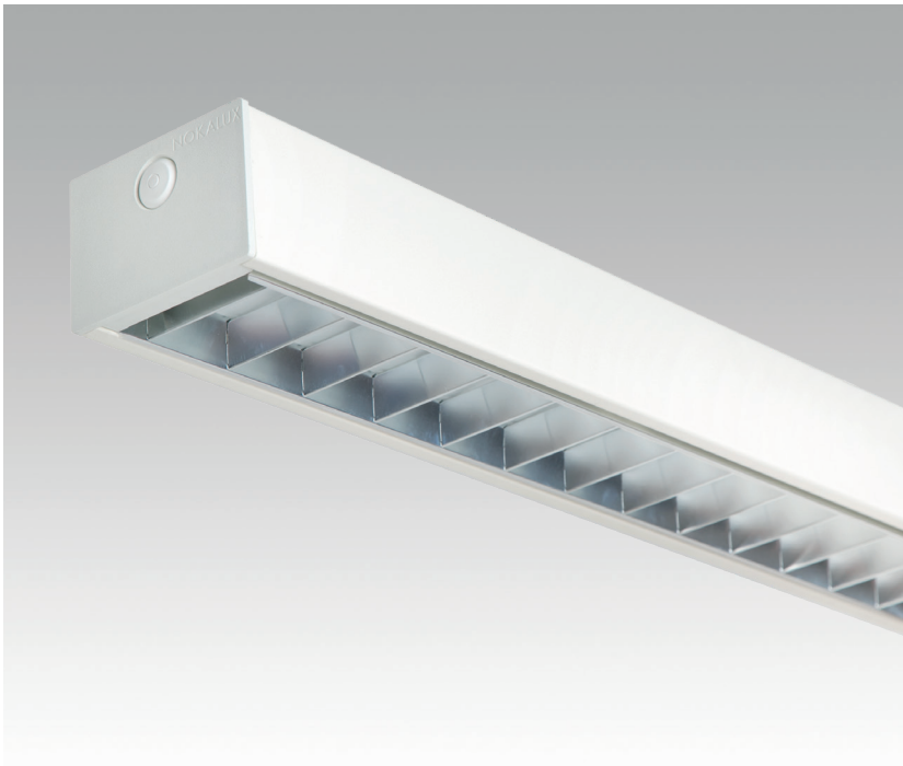
Pendant with upright