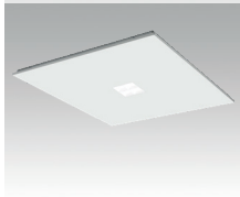
InLens 6.6 1500