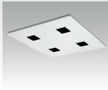
Louvre in inverted colour (to front)