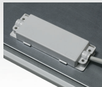
Terminal on top