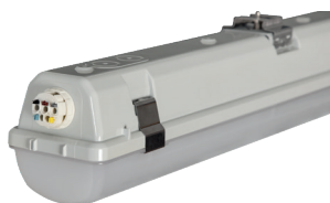
Quick connection in each end