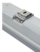
Detachable suspension brackets