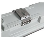
Detachable suspension brackets