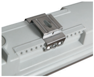
Detachable suspension brackets